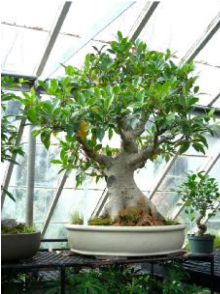
Ficus at the Monastery