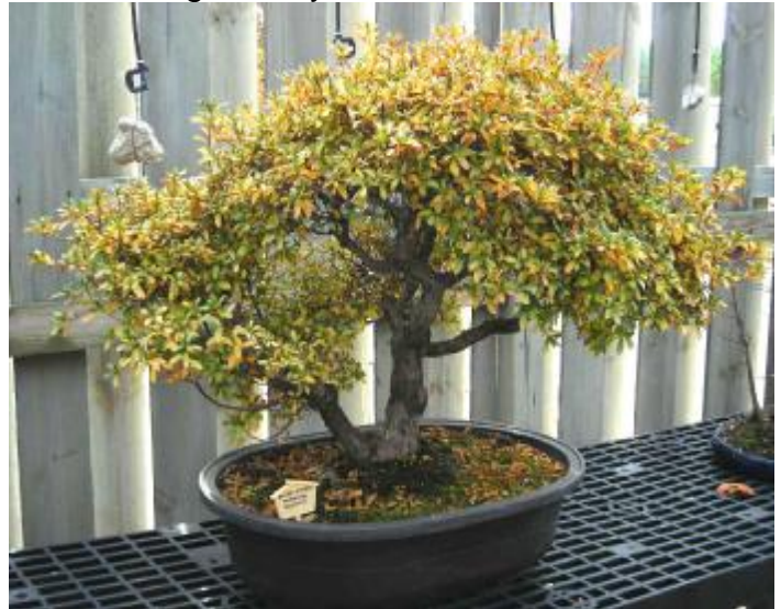
An azalea grown by the Monks

and tools they had miniature pots. Real mame and shito pots, which are very hard to find. I came away with their catalog, which they said they are in the process of updating onto their website - www.bonsaimonk.com . I look forward to the day that their pot inventory is fully online, until then I am glad that they are only a couple hours away from my mother's new house. If you ever find yourself in Atlanta, GA, it is well worth the time to stop!