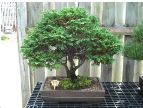
A beautiful juniper at the monastery.