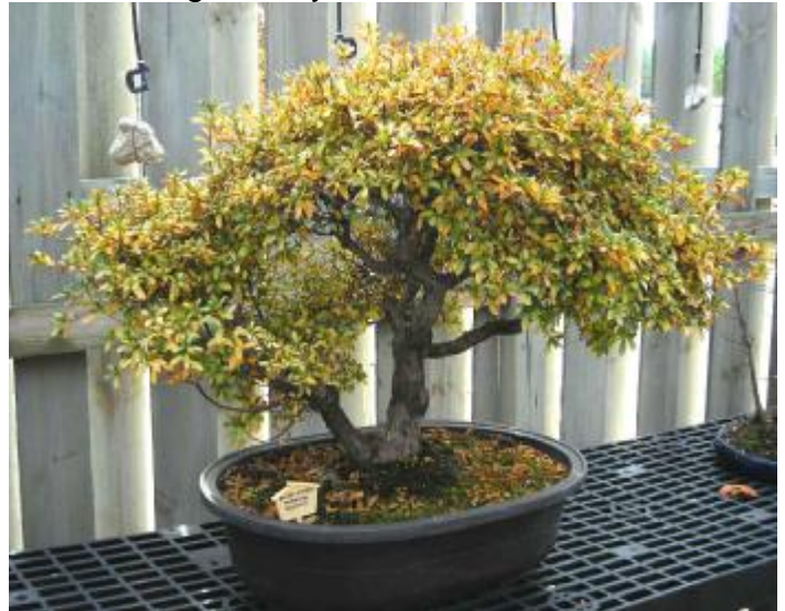
An azalea grown by the Monks

and tools they had miniature pots. Real mame and shito pots, which are very hard to find. I came away with their catalog, which they said they are in the process of updating onto their website - www.bonsaimonk.com . I look forward to the day that their pot inventory is fully online, until then I am glad that they are only a couple hours away from my mother's new house. If you ever find yourself in Atlanta, GA, it is well worth the time to stop!