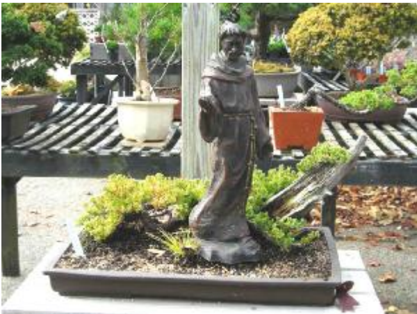
A monk with a juniper