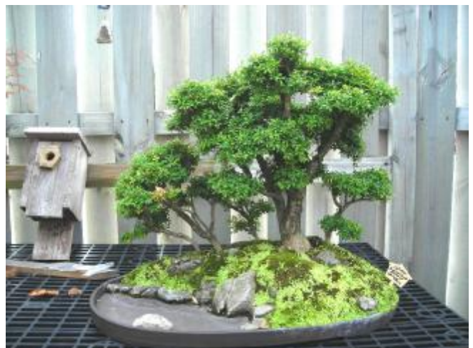
Boxwood Forest from the Monastery